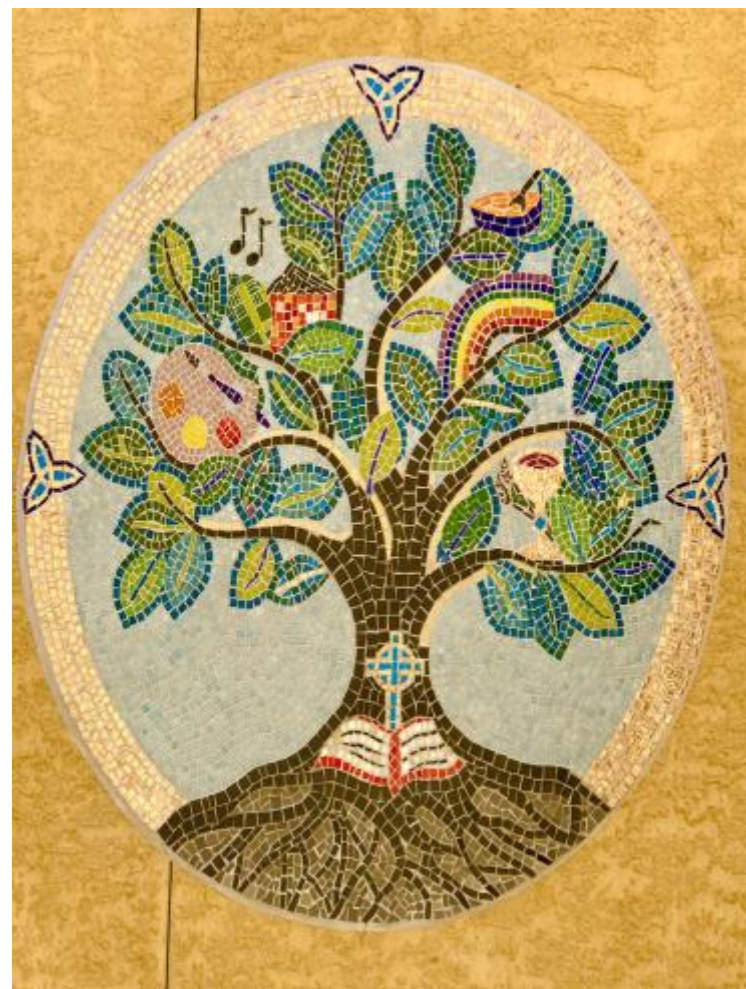
Sample mosaic from the artist